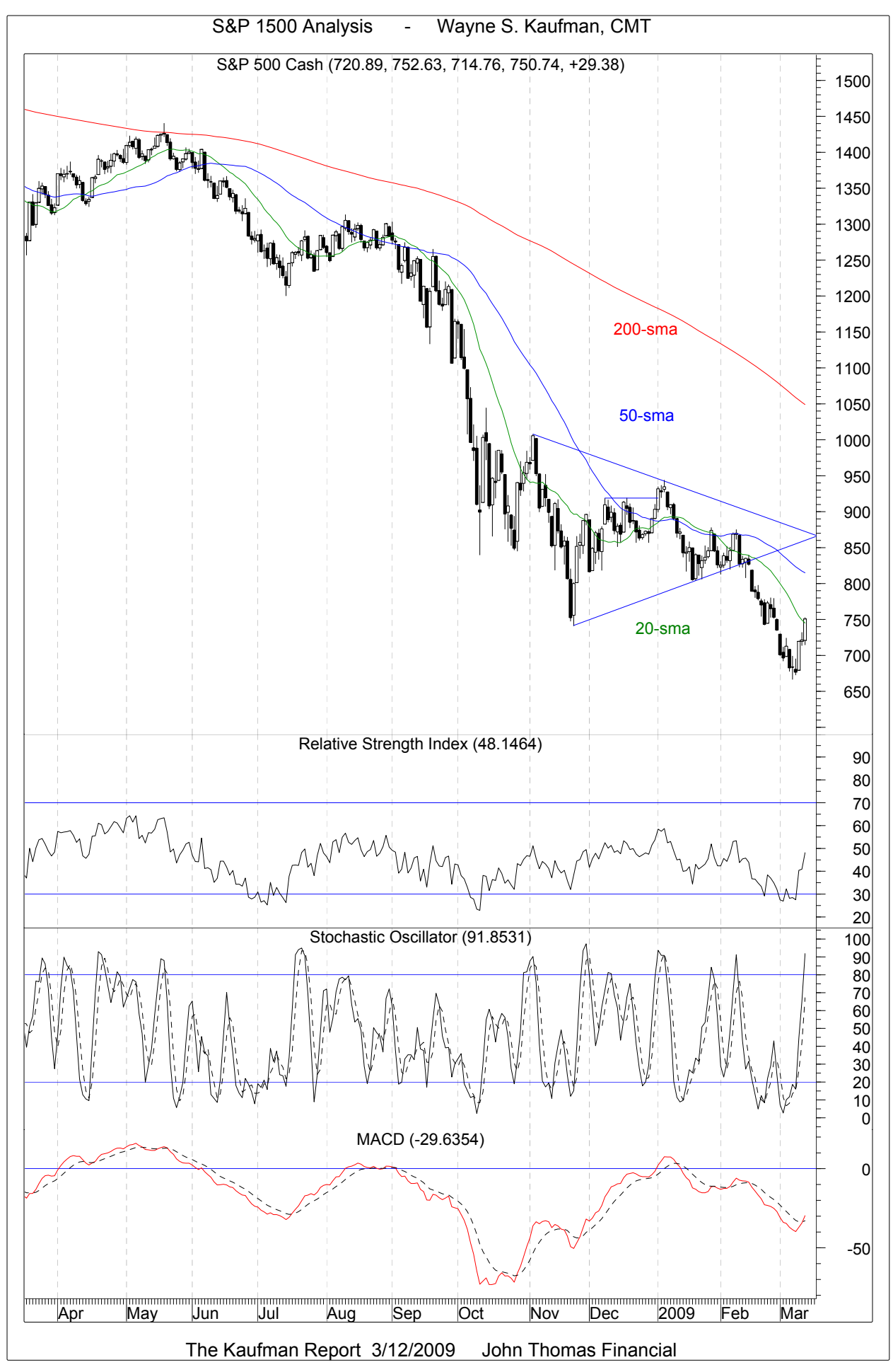
The S&P 500 closed above the 20-sma on the daily chart. On the weekly chart (not shown) unless there is a major reversal Friday a bullish engulfing candle will be printed.